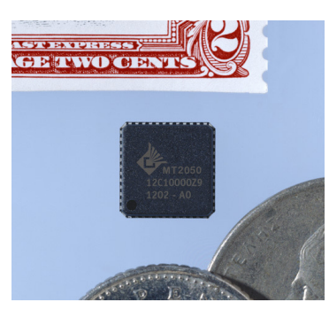
MT2050 Single-Chip Broadband Tuner

The MT2050 is a 5.0V single-chip broadband tuner with an integrated IF variable gain amplifier.